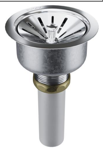
Lustrous Steel (LS)