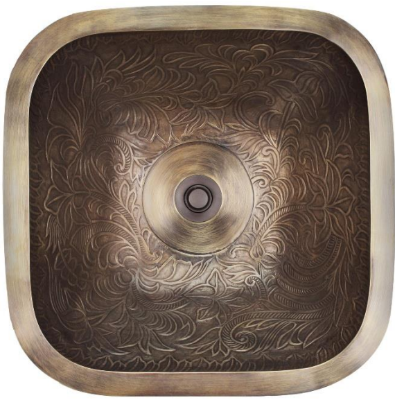
Shown in AB

Linkasink warranties our product to be free from manufacturing defect for the life of the product. Warranty does not cover improper care, neglect or abuse or normal wear-and-tear