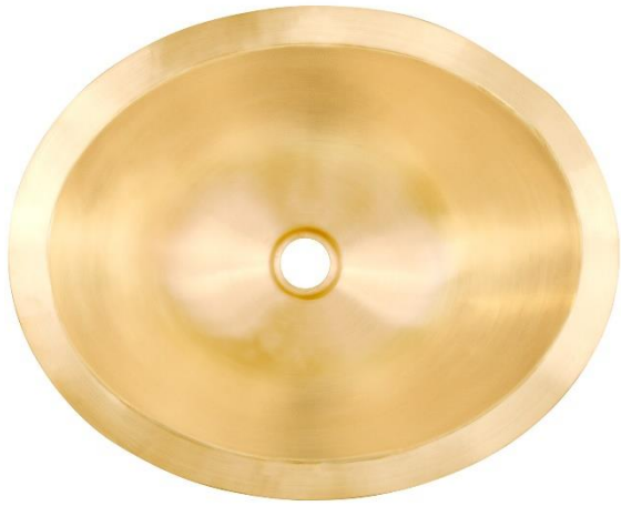
Shown in UB