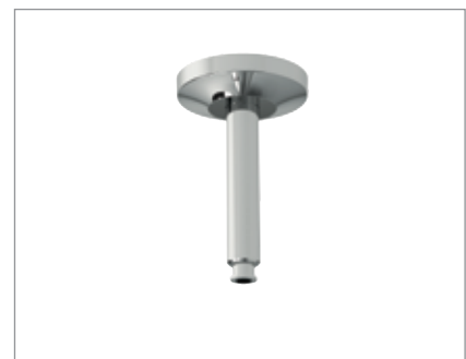
TS110MC6: Rain Shower Arm Ceiling Mount 6"