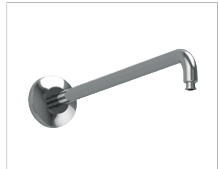
TS110MW16: Rain Shower Arm Wall Mount 16"

Please note the following components are sold separately